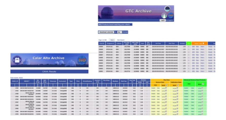
Figure 3. CAHA and GTC result web pages