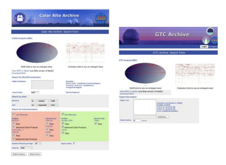
Figure 2. CAHA and GTC search web pages